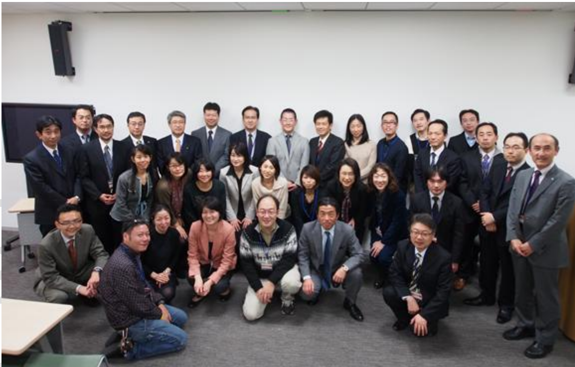
Picture of the participants at the forth workshop

I hope to carry the momentum to the next step in order to address human rights issues in business not as a pie in the sky notion but as actual practice. The next step will involve more concrete activities at individual companies.